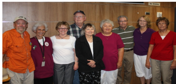
Board of Directors